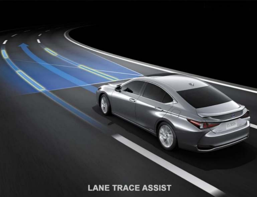
LANE TRACE ASSIST